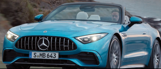
European image shown.